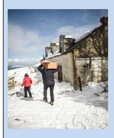
Argyll and Bute Scottish Government

Further information about this and other case studies of good practice in building community resilience to emergencies can be found at <a href="https://www.readyscotland.org">www.readyscotland.org</a>.