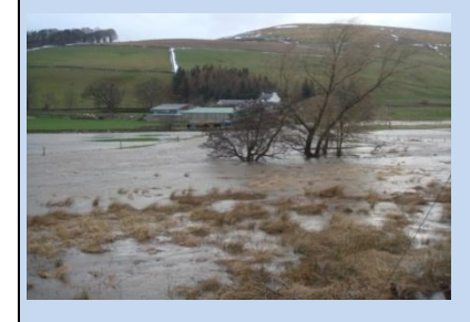
Eddleston Water Project Tweed Forum

This is a partnership project involving: Private land-owners, Tweed Forum, Scottish Government, Scottish Borders Council, SEPA, Dundee University, Forestry Commission Scotland and British Geological Survey.