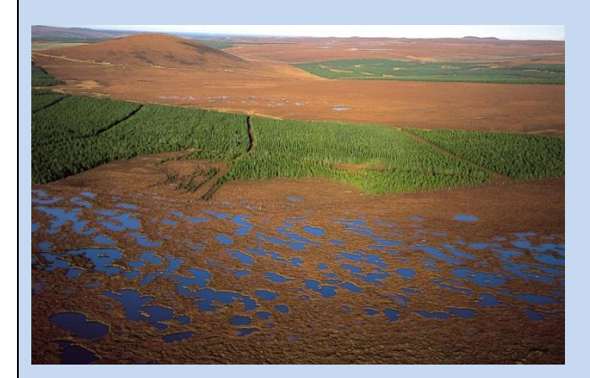
Royal Society for the Protection of Birds

Drains and ditches have been blocked across Forsinard to raise the water table, enable the bog surface to re-vegetate and new peat to form. Trees in forestry plantation have also been removed. The work has attracted wading birds, such as golden plovers, and breeding birds like hen harriers, short-eared owl and meadow pipits are returning to the areas previously covered by trees. Restoration has increased the resilience of the habitat and ensured it can withstand periods of dry weather and warmer temperatures.