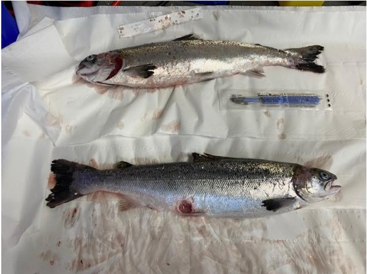
Figure 2 Fish 1 and 2 from the same pen. Fish 2 clearly shows the lesion on fish 2.