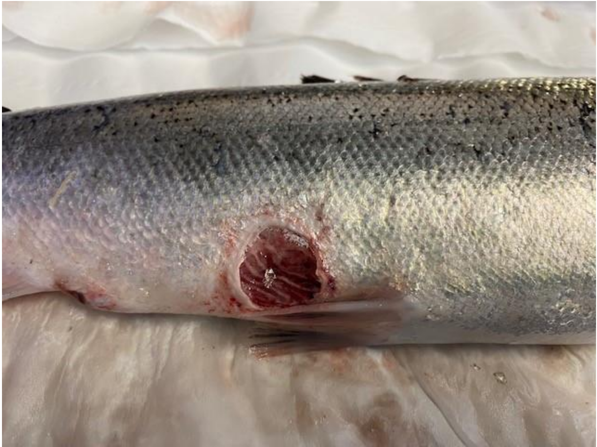
Figure 3 Closer view of the lesion on fish 2.