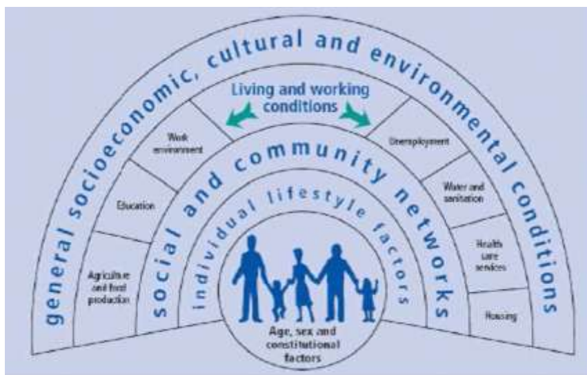
Dalgren and Whiteheads' determinants of health model (1991)

We know that health inequalities follow a social gradient and as such affect all population groups 11 . The importance of strengthening universal services is important to reduce the gap between groups. NHS maternity care services are unique in that they are the only universal public service for women and their babies during pregnancy and the early period of an infant's life. As such they are a vital component of, and gateway to, wider early years services including social care services, housing services, welfare services and the Third Sector.