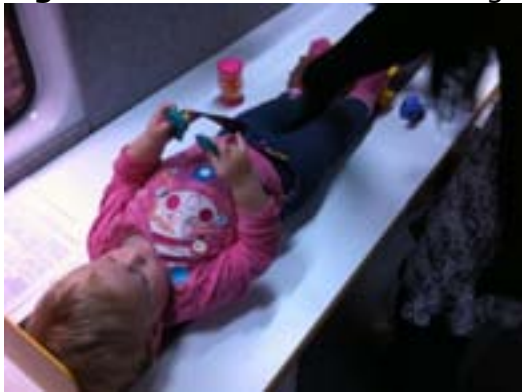
Figure A.2. Measurement of length

Occipito-frontal head circumference was measured using a Child Growth Foundation disposable head circumference tape 16 . The tape was placed around the child's head so that the tape lay across the frontal bones of the skull just over the occipital prominence at the back of the head (the widest part of the child's head).