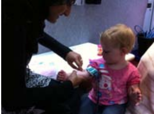
Figure A.6. Blood sampling

The EDTA monovette was sent to Addenbrookes Hospital in Cambridge by first class Royal Mail post on the day of sampling. Where at least 1ml of blood was achieved for this tube, a full blood count (FBC) analysis was undertaken.