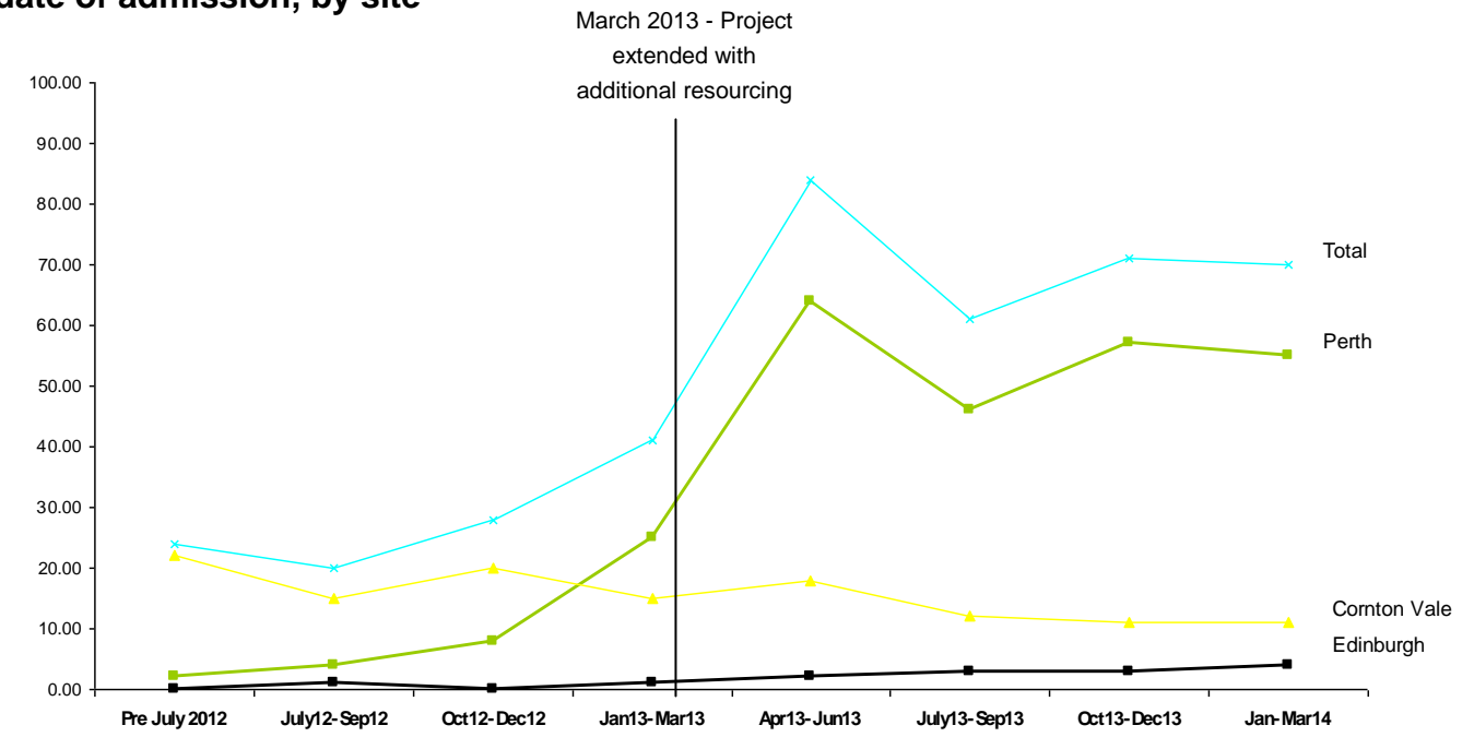
Figure 2.1 Number of offenders identified as eligible to participate in the CRP by date of admission, by site