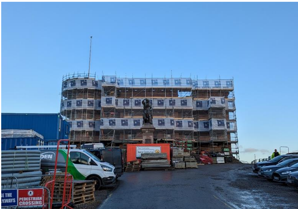
Figure 8. Inverness Castle

Project description: Highland Council are looking to develop a district heating network within the immediate area surrounding Inverness Castle which is a council administration centre. Potential heat sources include ground source heat pumps, river source heat pumps, sewer heat recovery, biomass and large scale air source heat pumps.