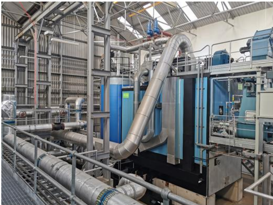
Figure 20. St Andrews

This project proposes the extension of an existing biomass heat network in and around St Andrews. Since its commissioning in 2017 the existing heat network, sourced by a 6.5MW biomass boiler has provided heating and hot water to 50 University campus buildings via 27 km of pipe, accumulating savings of 20,000 tCO 2 e. The feasibility study will explore different options to identify a preferred extension scenario, which could include public sector buildings, schools and hospitality venues.