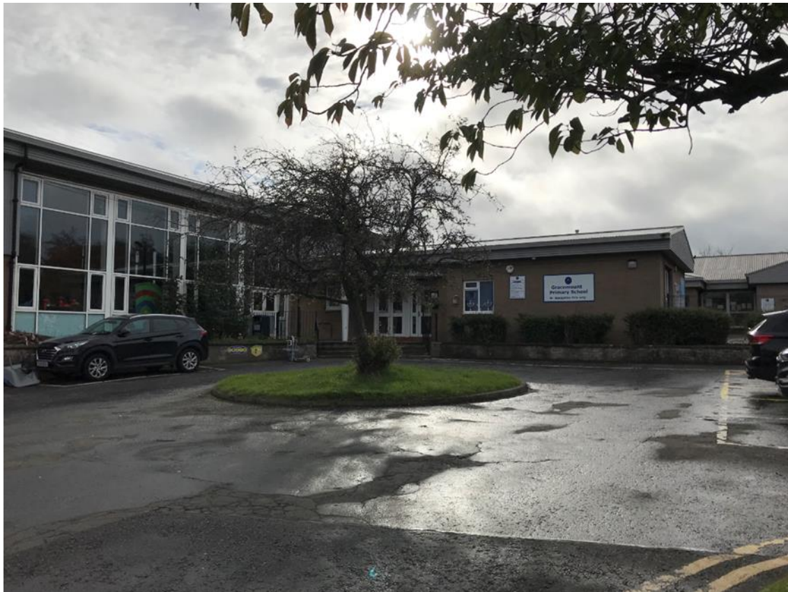
Figure 17. Gracemount Primary School (Credit: Buro Happold on behalf of Zero Waste Scotland)

Network for public sector buildings including council-owned offices, an NHS health centre and an Edinburgh Leisure building in close proximity. The project proposes using both air source and ground source heat pumps to provide low carbon heat.