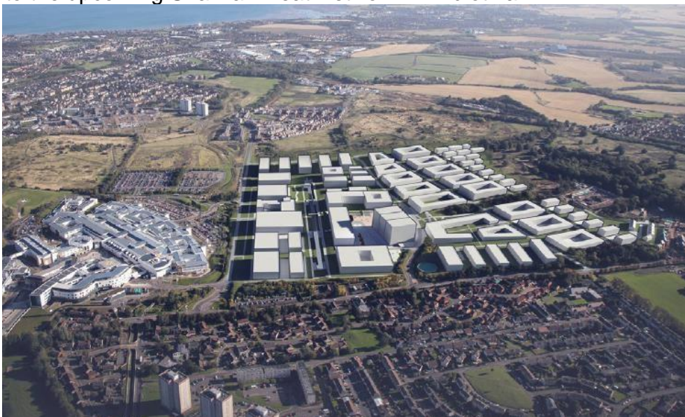
Figure 5. Aerial view of the Edinburgh BioQuarter site (Credit: Oberlanders Architects)

The project explores the supply of heat to the Edinburgh BioQuarter site via a heat network. This is proposed to serve new buildings on Edinburgh's BioQuarter site masterplan, with connection to existing buildings on site in due course, including the NHS Royal Infirmary of Edinburgh and the Royal Hospital for Children and Young People, and the potential to serve social housing off-site. The feasibility study examines the potential for a new heat network or connection to the upcoming Shawfair Heat Network in Midlothian.