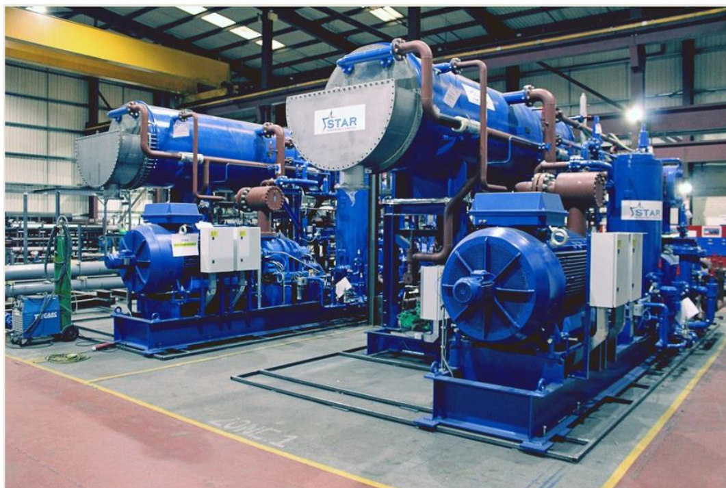
Figure 12. Queen's Quay Energy Centre

The project proposes the extension of the Queens Quay heat network to connect to the Golden Jubilee Hospital and hotel as well as nine of West Dunbartonshire Council's multiblock flats at Dalmuir and Littleholm (6 currently on electric, 3 on gas).