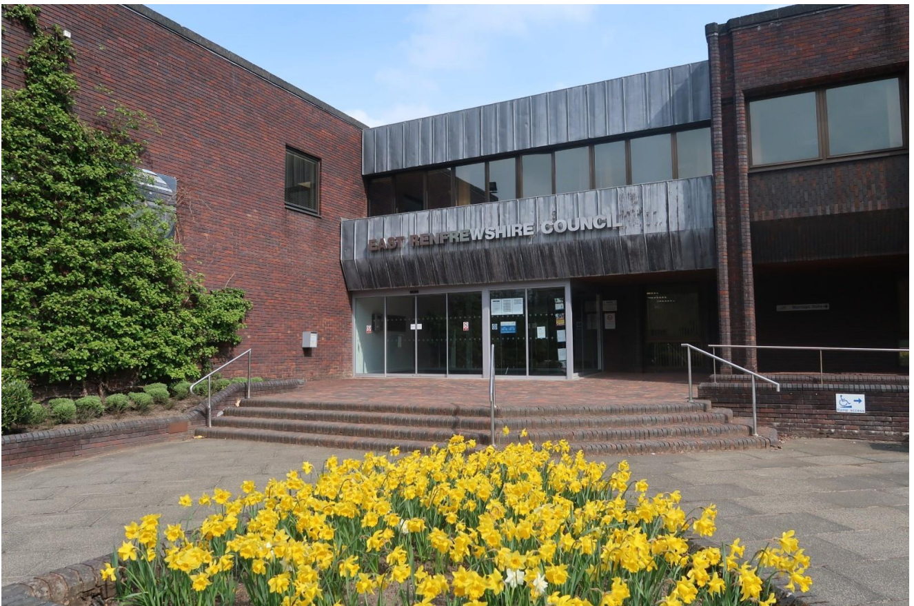
Figure 19. Example of Eastwood Park Council building

Project description: This project proposes a new heat network with sewer water heat recovery as a potential source. The proposed heat network would supply public sector buildings that include Eastwood Park Campus, schools and a leisure centre.