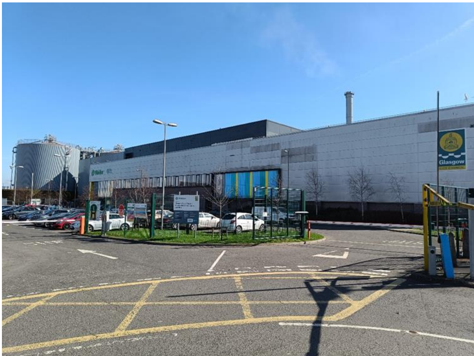
Figure 11. Glasgow Recycling and Renewable Energy Centre (GRREC)

Project description: Project secured grant funding to undertake a review of prior feasibility work to determine the potential for the Glasgow Recycling and Renewable Energy Centre (GRREC) to be used as a heat source for a district heat network serving a mix of domestic and non-domestic properties in the south side of Glasgow.