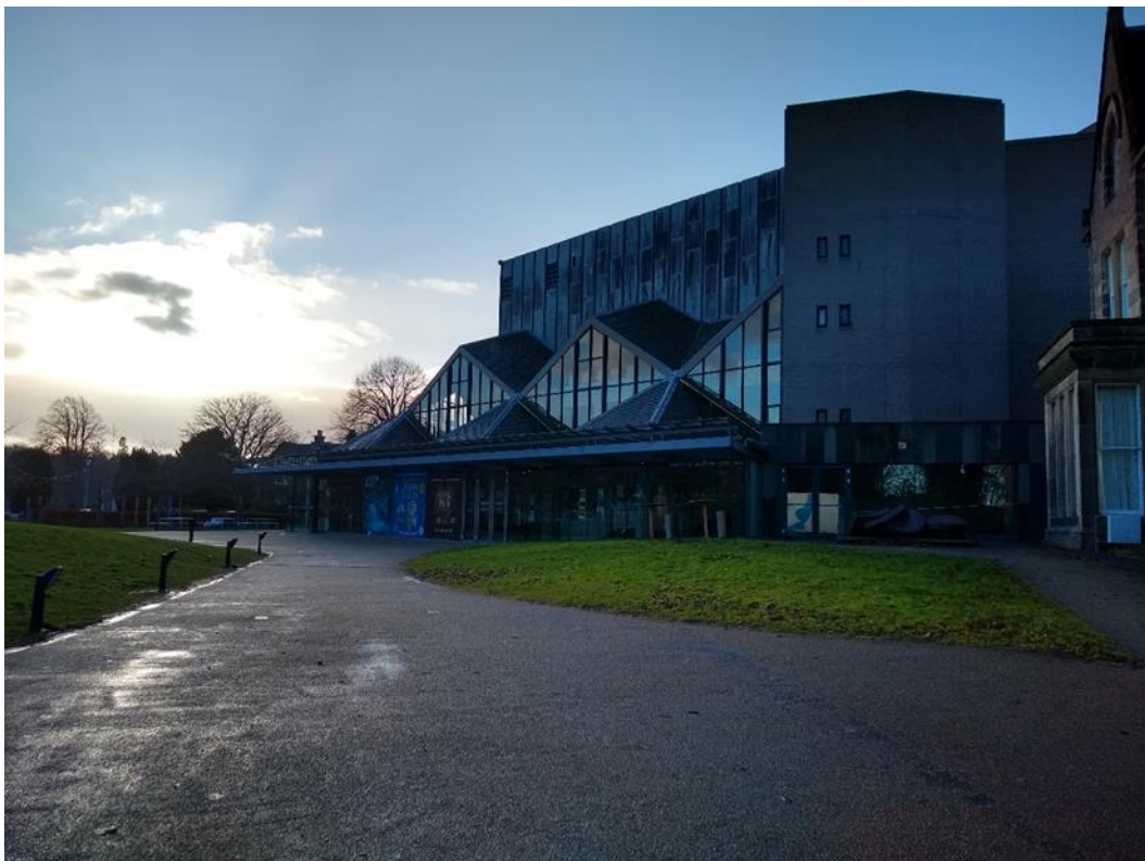
Figure 7. Eden Court and the Highland Council offices, Inverness

The Highland Council are looking to establish district heating networks within Inverness. The main buildings identified for connection include Inverness Leisure Centre, Inverness Ice Centre, Highland Archive and Registration Centre, Inverness Botanic Gardens, Highland Council HQ and Eden Court.