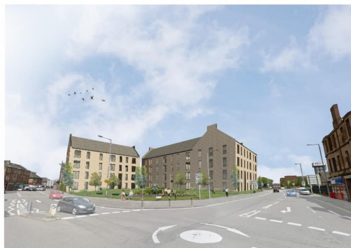
Figure 2. 3D image of North Lanarkshire Council's social housing project plan (© Coltart Earley Architects)

The project is due to begin construction in March 2023 and commission in May 2026.