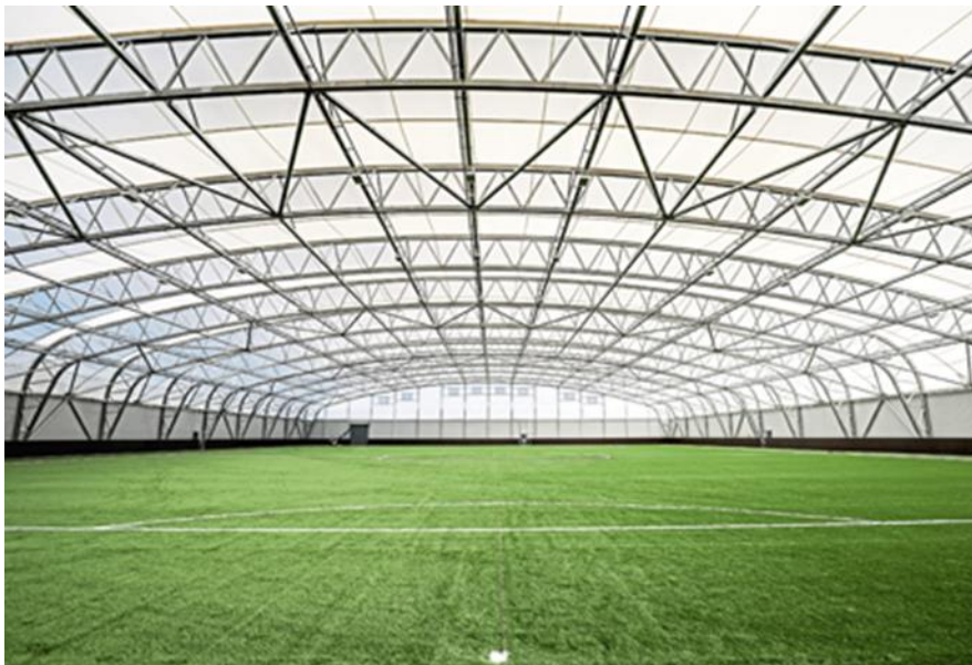
Figure 6. Regional Performance Centre, Dundee

Project description: The Caird Park project was originally supported by the Low Carbon Infrastructure Transition Programme. A pre-feasibility study to expand the network was published in January 2022 as part of an initiative to boost heat networks by the Scottish Cities Alliance. This study analysed opportunities to expand the existing network towards additional heating loads (a school, a college, a sports centre and a gymnastics centre). The project aims to deliver these expansions to their heat network.