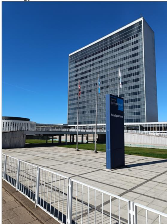
Figure 15. South Lanarkshire Council HQ Building

Proposed heat network centred around the council headquarters, and investigating the connection of several other non-domestic public sector properties, tower blocks and proposed new-build housing in the area. Ground source heat pumps are the recommended primary heat supply technology.