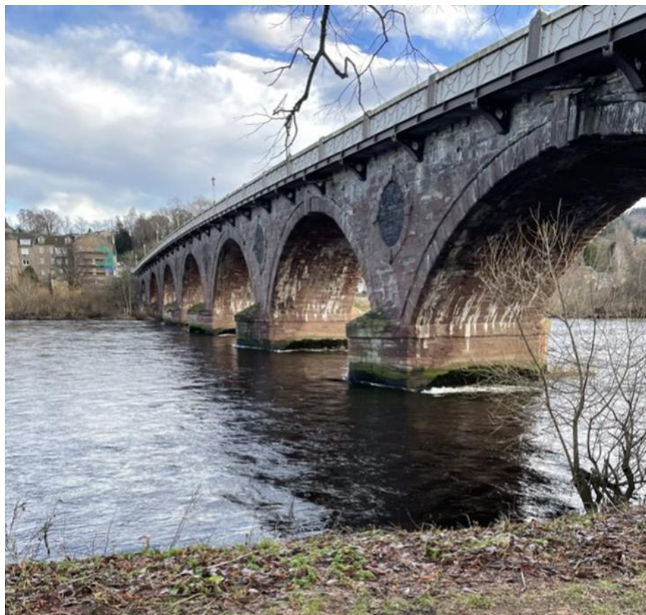
Figure 9. River Tay

Various non-domestic and domestic buildings including a concert hall, council offices, tower blocks and a hotel have been identified within Perth city centre that are potential connections for a heat network. A range of low carbon heat sources are recommended to be considered including river and ground source heat pumps.