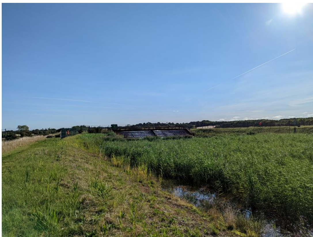
Figure 16. Water treatment reed bed lagoons at minewater site

The project involves a quarry and mine regeneration scheme creating new-build residential and commercial properties. A suggested approach is recovering heat from minewater which will be fed through an ambient loop to households each of which will have individual heat pumps.