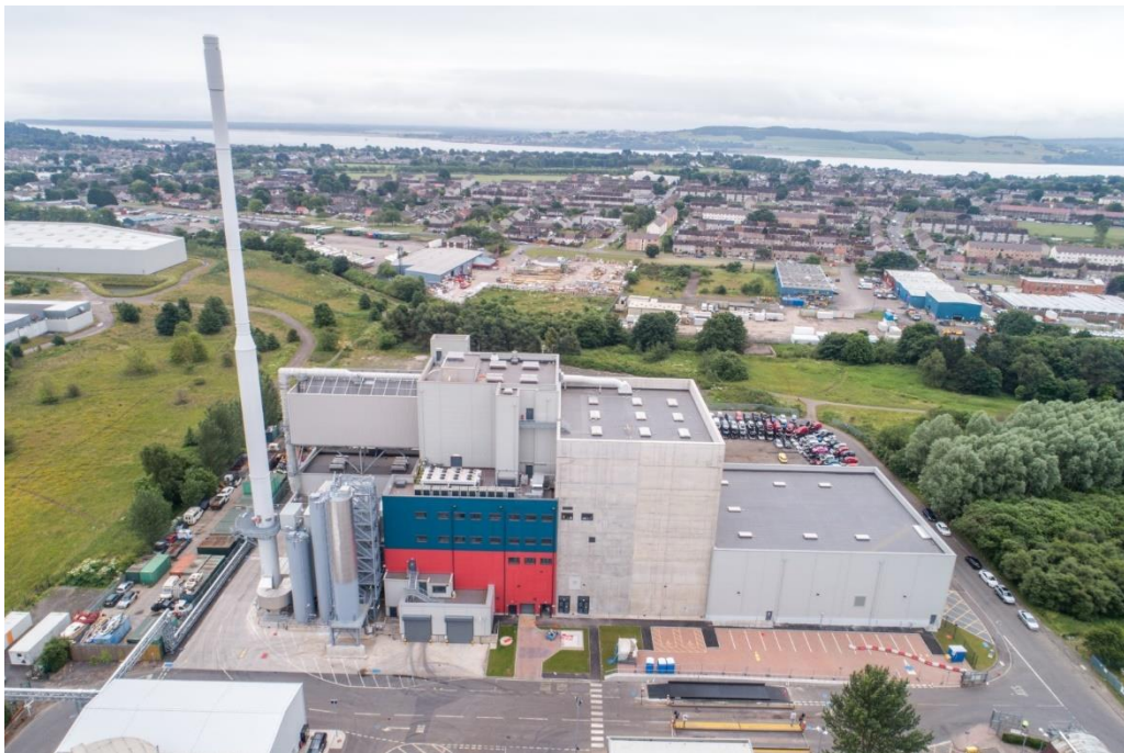
Figure 21. Baldovie EfW facility

This project proposes the creation of a heat network for the Whitefield and Douglas area with heat supply from the Baldovie Energy from Waste facility. The proposed heat network would supply a newbuild school with potential to extend the scheme towards Dundee City Centre.