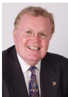
Michael Matheson MSP Minister for Public Health