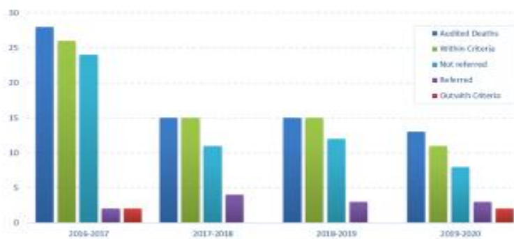
Outcome of Referred Cases