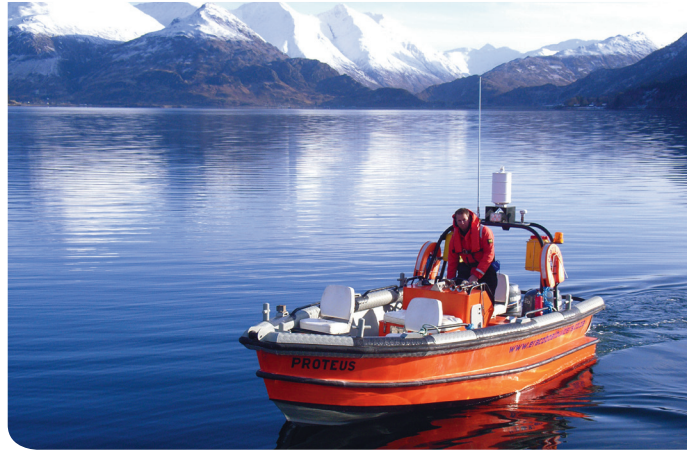
ALUMINIUM WORKBOAT PROTEUS

manoeuvrable, which is a major benefit for any scientific vessel. Coupled with the Kongsberg DP system, this allows total control of all propulsion units - which greatly enhances the vessel's ability to maintain station when deploying scientific equipment.