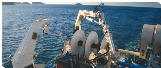
CRANE AND NET-DRUM

Alba na Mara is fitted with three trawl winches each carrying 800 metres of 20mm diameter wire. These winches will allow her to operate a single demersal trawl, a twin demersal trawl or a pelagic trawl. The ability to twin trawl is particularly useful as it augments Marine Scotland' ability to carry out fishing gear research to investigate technical measures. The aim of these measures is generally to facilitate selective escape of immature fish or of particular fish species from the trawl. The single demersal and pelagic trawls are used for stock assessment purposes.