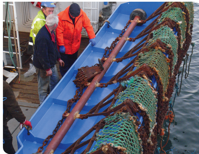
TRAY SYSTEM BEING TRIALLED

The vessel is fitted with deployable scallop arms that allow the vessel to tow two sides of six standard dredges, one per side. The vessel is also fitted with a novel tray system for dumping stones and other debris from the dredges overboard. This reduces the work in clearing debris from the deck and speeds up operations when scalloping.