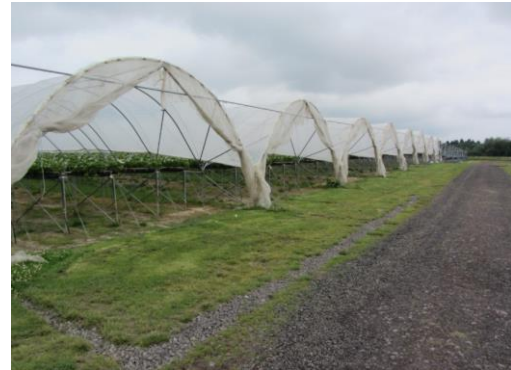
Figure 4: General Polytunnel arrangement