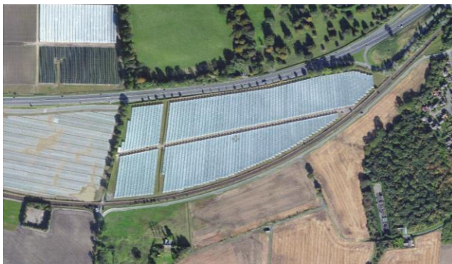
Figure 3: Extent of Polytunnels