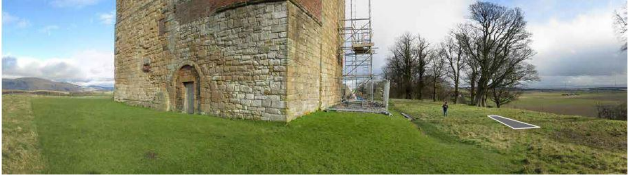
Figure 2 - Location for beacon/bench in grey (From Project Design)