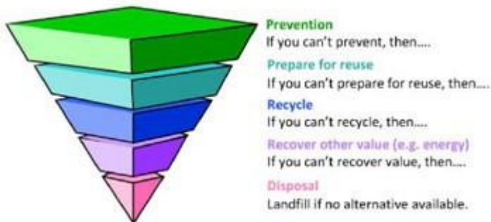
Figure 2: the waste hierarchy

Another way to describe this is the ‘waste hierarchy’, which describes the order of preferences for action to reduce and manage waste (figure 2). This sets out the optimal use for materials, starting with prevention (an alternative term for ‘reducing’ the use of materials), moving to reuse and then recycling, including energy and material recovery. It is only when we have exhausted all of the other alternatives that disposal through landfill should be used. A circular economy should always endeavour to keep materials in use as high up the waste hierarchy and for as long as possible.