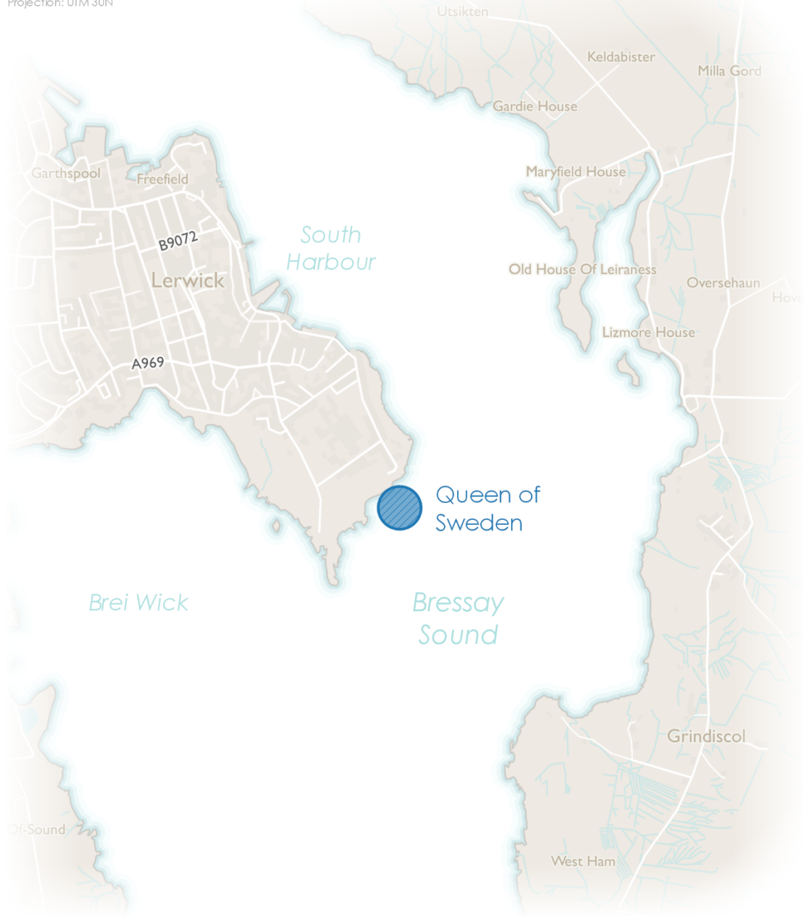
Figure 2: The Queen of Sweden site – the total area proposed for designation is 0.02 km 2

Contains information from Historic Environment Scotland & Scottish Government (Marine Scotland) licensed under the Open Government Licence v3.0. Projection: UTM 30N