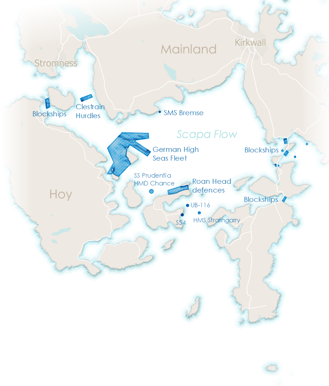
Figure 3: The Scapa Flow proposal– the total area proposed for designation is 10.69 km 2 .

Contains information from Historic Environment Scotland & Scottish Government (Marine Scotland) licensed under the Open Government Licence v3.0 and data © British Crown & OceanWise. Licence No. EK001-20140401. Projection: UTM 30N