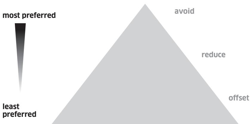
Figure 2 - The mitigation hierarchy

4.30 The aim of EIA is to avoid, reduce and offset any significant adverse environmental effects arising from a proposed development. The most effective mitigation measures are those which avoid or prevent the creation of adverse effects at source and ideally such measures should be identified during the project design stage. See paragraph 6.5 on 'costs and benefits of EIA'. The aim should be to prevent or avoid the effects if possible, and only then consider other measures.