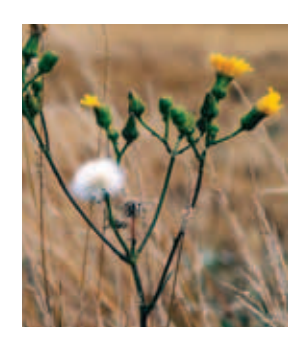
Ox's tongues Picris spp.