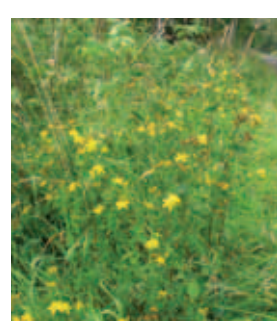
St. John's worts Hypericum spp.