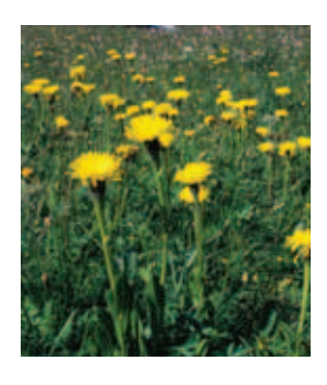
Cat's ears Hypochaeris spp.