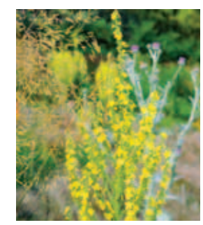
Mulleins Verbascum spp.