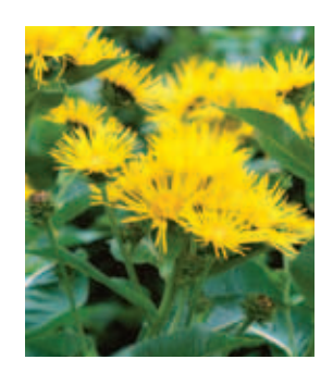
Elecampane Inula helenium