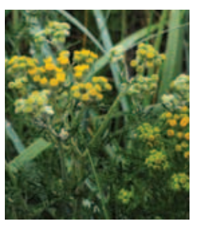
Horay Ragwort Senecio erucifolius