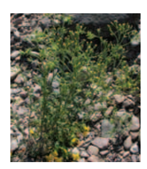
Heath Groundsel Sencio sylvaticus