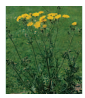
Hawk's beards Crepis spp.