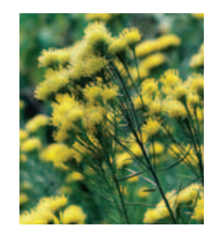
Goldilocks aster Aster linosyris