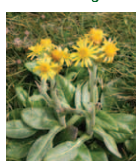
Field fleawort Tephroseris integrifolia