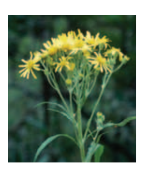
Fen Ragwort Senecio paludosus