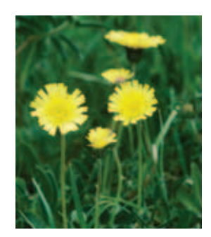
Hawkweeds Hieracium spp.