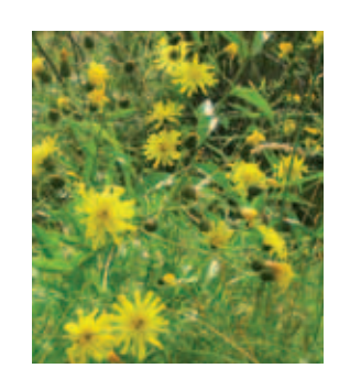
Sow Thistles Sonchus spp.