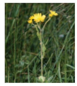
Marsh Ragwort Senecio aquaticus

Whilst only the more frequently found Common Ragwort is subject to the provisions of the Weeds Act, there are other members of the same native species family which can cause some identification problems. Marsh Ragwort ( Senecio aquaticus ) is locally abundant in wet areas of fields, ditch banks and marshes. Hoary Ragwort ( Senecio erucifolius ) occurs mainly on roadsides, semi-natural meadows and field boundaries. Oxford Ragwort ( Senecio squalidus ) grows widely on roadsides, railway land, old walls and unmanaged land.