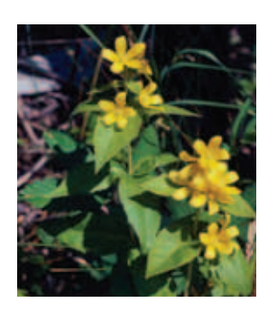
Yellow Loosestrife Lysimachis vulgaris