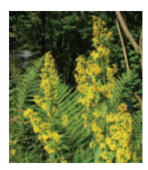
Goldenrod Solidago virgaurea