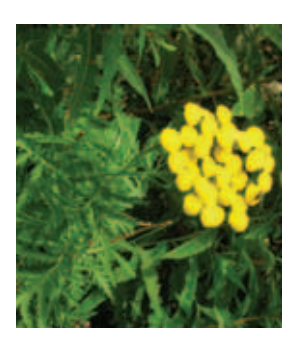
Tansy Tananetum vulgare