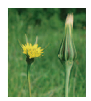
Goatsbeard Tragopogon pratensis