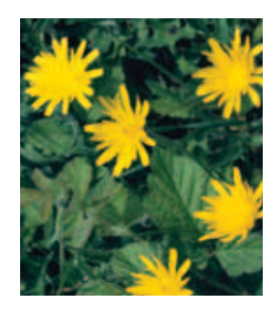
Hawkbits Leontodon spp.