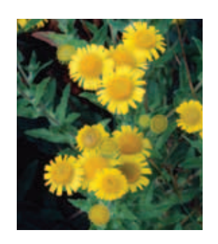
Fleabane Pulicaria vulgaris