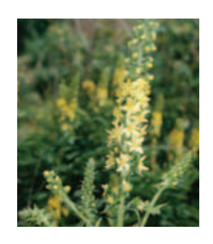
Agrimonies Agrimonia spp.