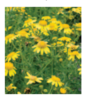
Oxford Ragwort Senecio squalidus