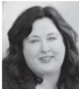
ADAM INGRAM MSP Minister for Children and Early Years