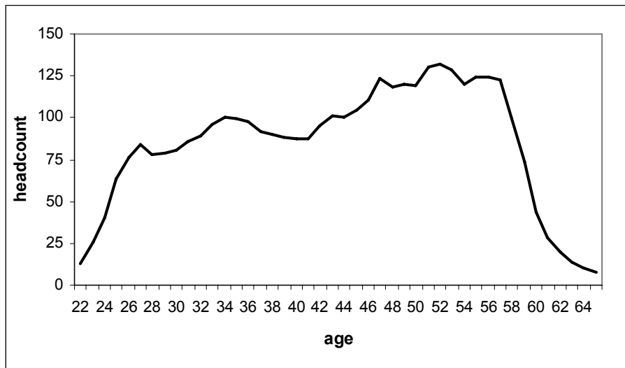
Chart 3: Age of teachers at independent schools, 2005 (1)

(1) This graph has been smoothed using a three-year moving average. There were 123 FTE teachers for which age data was unavailable or outwith the range in the table.