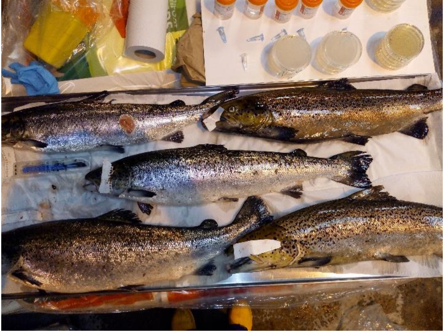
Fish 1 to 5