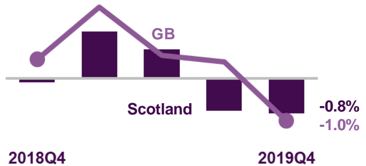
Growth in Sales Volume

Over the same period Great Britain's sales volume contracted by -1.0%.