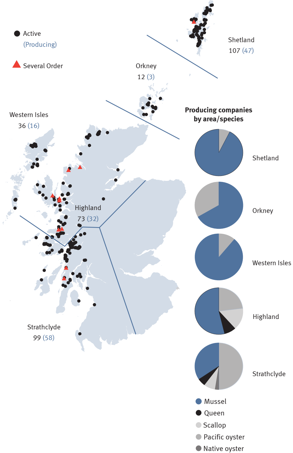
FIGURE 2 : A map of Scotland showing the regional distribution of shellfish production sites in 2006, and producing companies by area/species.