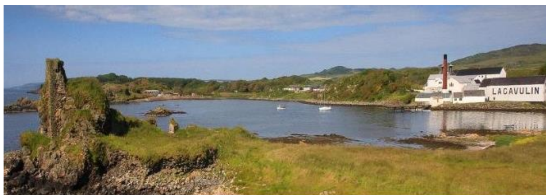
Remains of Dunivaig Castle (from submitted Project Design)