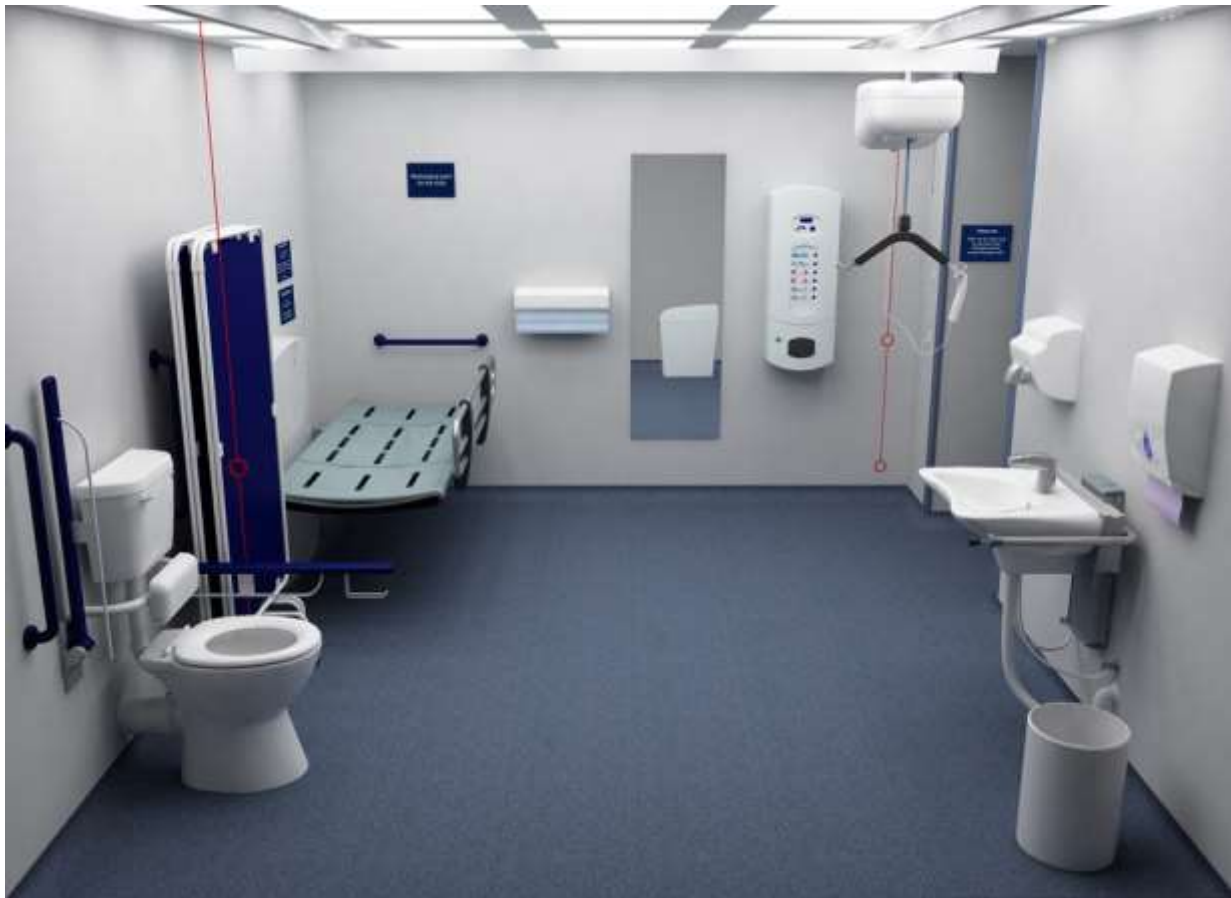
Example of a Changing Places Toilet © Changing Places Consortium 2019